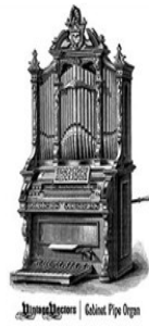
Almshouse Almshouse | Galton Pipe Organ

Thank you to everyone who contributed cakes, their time and effort to the Village Hall Christmas Market on 30th November. We raised £74.60 which was a good sum, given the stiff competition from 2 larger events held at the same time elsewhere! £25 was raised by the cake stall and £29.60 from the 'coffee shop'. All money raised has been donated to the Village Hall double glazing fund.