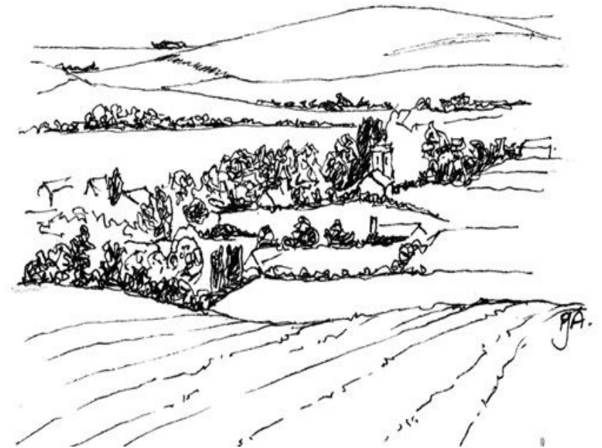
Kingston Deverills from the west by Pat Armstrong